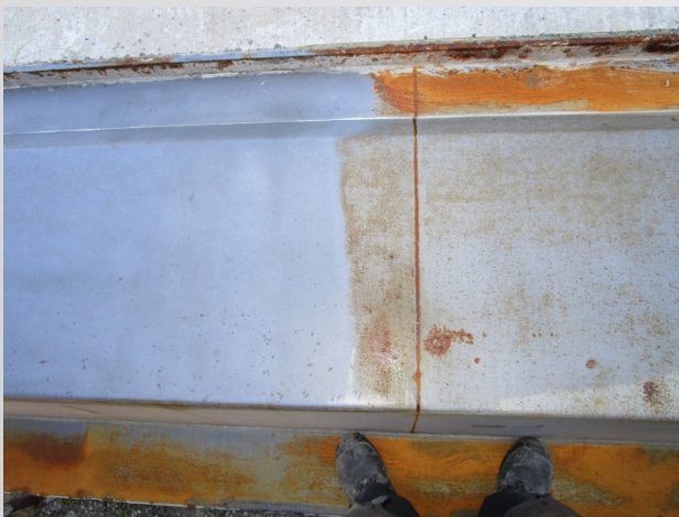
Left: after application of Tectyl 5506W / Right: without application of Tectyl 5506W

After three months of outdoor storage, molds treated with Tectyl 5506W showed clear protection against corrosion, while untreated molds exhibited visible rust and surface degradation. This case demonstrates how preventive corrosion protection with Tectyl enables concrete manufacturers to reduce costs, protect critical assets, and maintain high production standards. In addition, the preventive coating helped maintain the usability of molds without extensive mechanical cleaning before returning them to production. This contributes to more predictable production scheduling and reduces the risk of surface damage caused by aggressive cleaning methods.